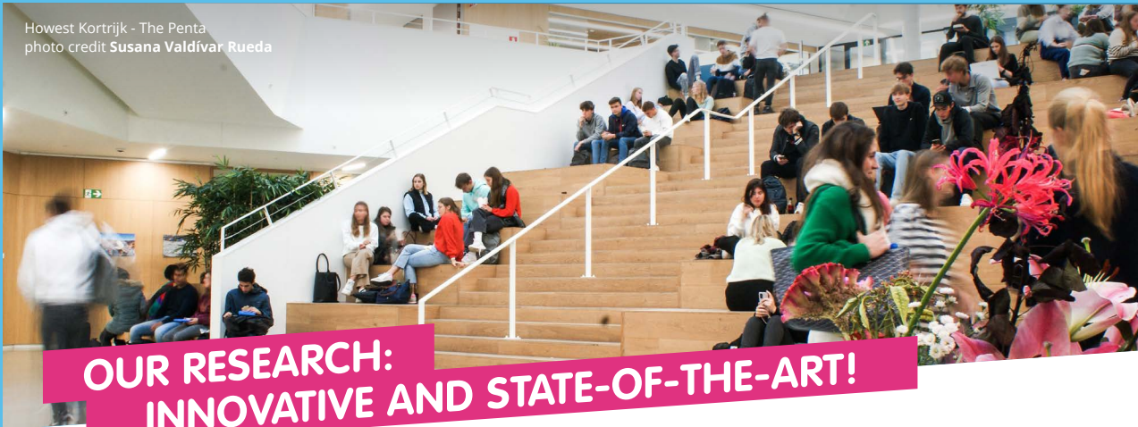
Howest Kortrijk - The Penta