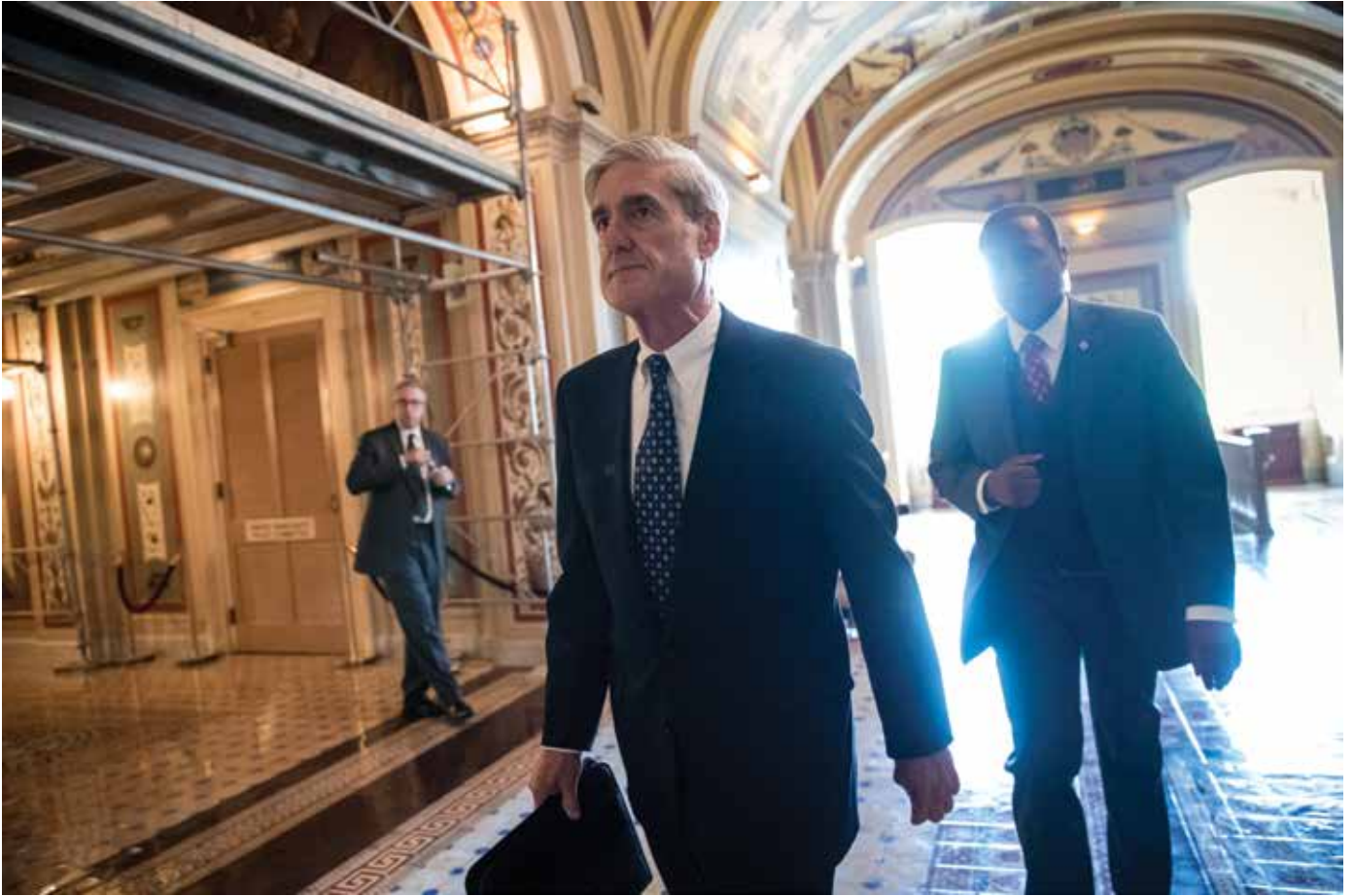
In this June 21, 2017, file photo, special counsel Robert Mueller departs after a closed-door meeting with members of the Senate Judiciary Committee about Russian meddling in the election and its possible connection to the Trump campaign, at the Capitol in Washington.

This leads to the bipartisan fear now in Congress that the current president may frustrate or even close down the special counsel's investigation into any collaboration between the Trump campaign and Russia in the 2016 presidential election. The special counsel is an office created by Department of Justice regulations that is specially designed to fill the gap in our Constitution of an independent prosecutor. By department regulation, the special counsel enjoys independent authority to investigate and prosecute illegalities in the White House. Still, bipartisan groups of senators are sufficiently concerned that President Donald Trump may try to thwart the efforts of the special counsel that they have introduced two different bills to protect that office. These bills, in turn, raise their own separation-of-powers issues.