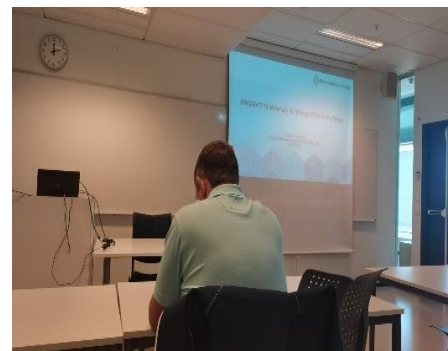
Høgskolen i Østfold 校园环境及教室内环境