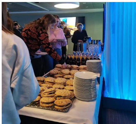
Telenor Group 公司午餐时间